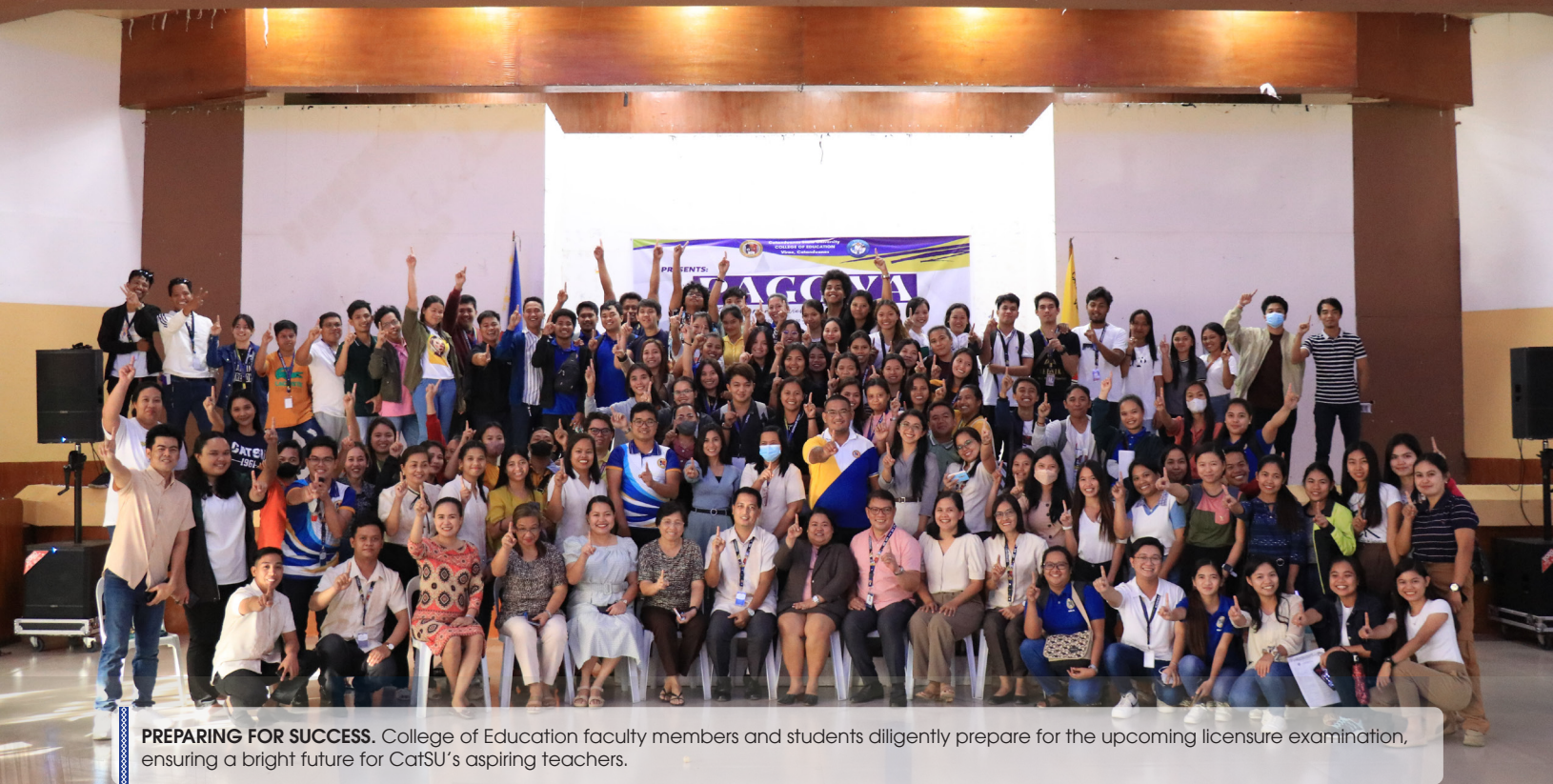
PREPARING FOR SUCCESS. College of Education faculty members and students diligently prepare for the upcoming licensure examination, ensuring a bright future for CatSU's aspiring teachers.