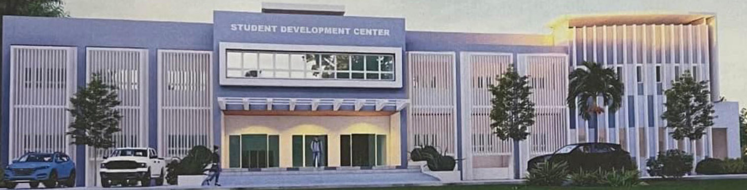
Proposed Student Development Center of CatSU