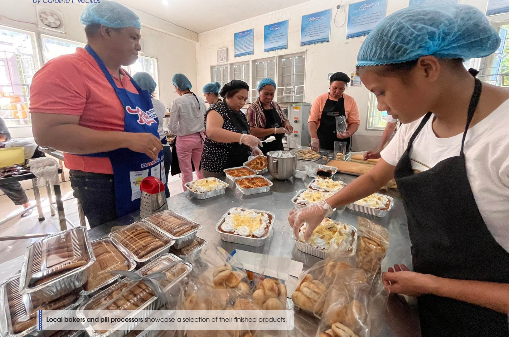
Local bakers and pili processors showcase a selection of their finished products.

The Shared Services Facility (SSF) or Foodlab Center, under the auspices of CatSU College of Industrial Technology (CIT), was filled with bakers and local pili processors participating in a Skills Training on Pili-based pastries held on Friday, March 10, 2023.